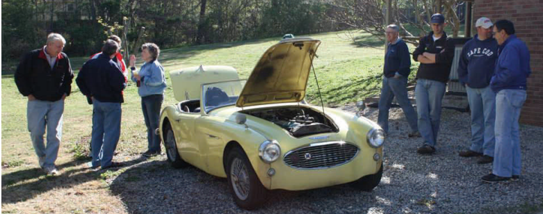
Gathering of the usual suspects & Steve's Barn Find 100/6

Approximately 15 members gathered on April 2 at Steve Drabant's Garage to inspect his "barn find" 1957 Longbridge 100/6 and partake in conspicuous consumption of coffee & donuts. After a through inspection a drive was made to the GA Tech Auto show where the Healeys made an impressive display.