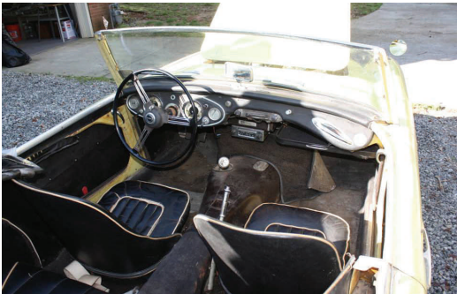
Original 1957 interior