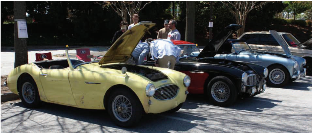
At the GA Tech Show -