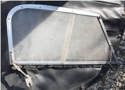
Early style side curtains