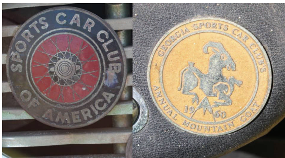
Period Sport Badges