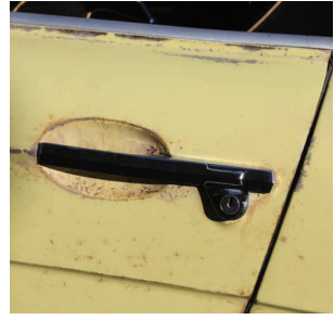
locking left door handle