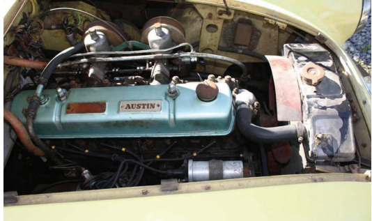
Austin 2-Port, 6 cylinder and the start of the famous Healey sound for the next decade