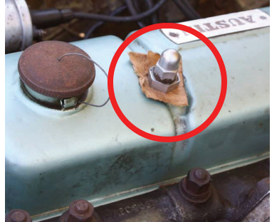
Parking lot repair oil stopper