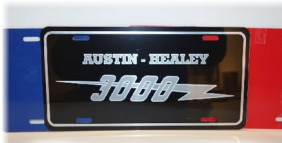
$22.00 License Plate Red, blue, black