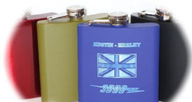
$22.00 6 oz Flask black, blue, green, red