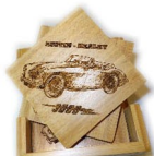
$32.00 Bamboo Coasters Set of Four

These non-apparel items below will be made with logos of your specific Austin Healey model.