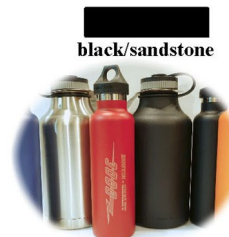
21 oz $28.00, 64 oz $46.00 Water Bottles Blue, black, red, orange